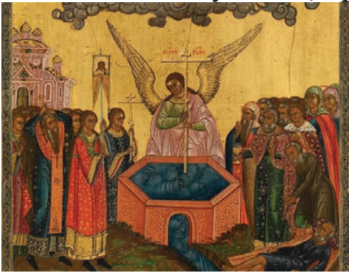
The Story of the Exaltation of the Holy Cross:

Early in the fourth century, Saint Helena, mother of the Roman Emperor Constantine, went to Jerusalem in search of the holy places of Christ's life. She razed the second-century Temple of Aphrodite, which tradition held was built over the Savior's tomb, and her son built the Basilica of the Holy Sepulcher on that spot. During the excavation, workers found three crosses. Legend has it that the one on which Jesus died was identified when its touch healed a dying woman.